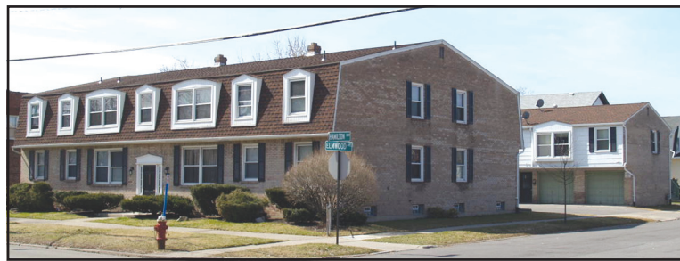
Elmwood Apartments, 2600 Elmwood Ave., Tonawanda

Apartments at 13205 Park St. and the 12-unit Elmwood Apartments at 2600 Elmwood Ave., Tonawanda. The properties sold for a combined total of $913,000. Waterman Estates sold the Alden property and purchased the Elmwood property utilizing a 1031 tax deferred ex-